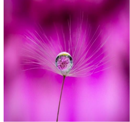
Gary Schwendener 1 st Place & Best Picture Digital “Drop with Flowers”