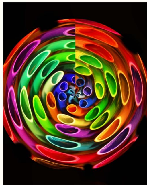
Kathie Phillips "Little Things Kaleidoscope" 2 nd Place