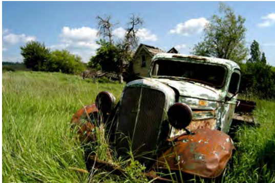
"Out to Pasture"