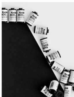
"Tumble from Memory"