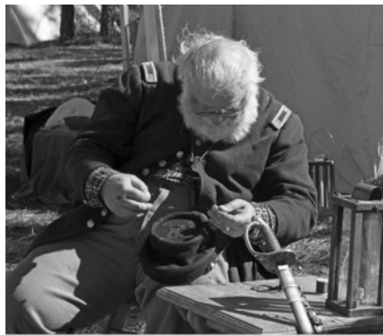
"Mending one's Hat" By Hazel Lacks Honorable Mention, Monochrome, Class B