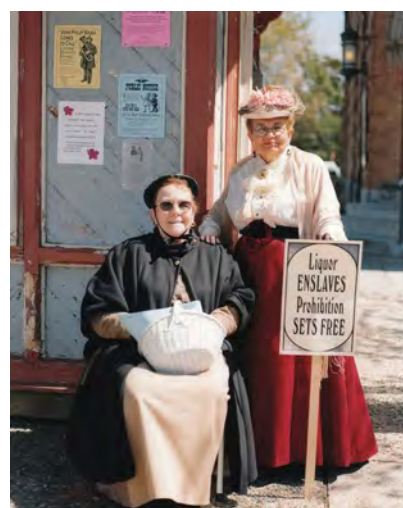
"Prohibition" By Kathy Graham First Place, Color, Class B