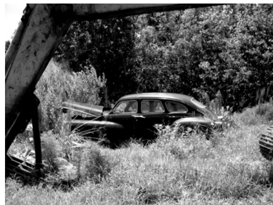
"10 Acres Relics" By Susan Steinke Second Place, Monochrome, Class B