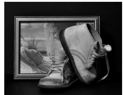
Taken with a Nikon D5000. The baby in the photo just turned 20.