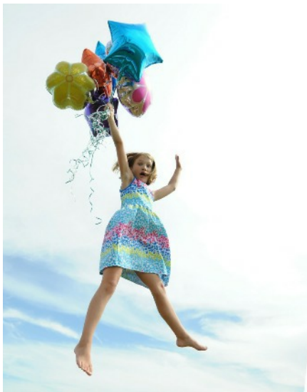
Up, Up & Away By George Bollis Class A Color Third Place