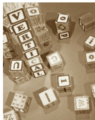
Vertical Structure By Rebekah Arrington Class B Color First Place