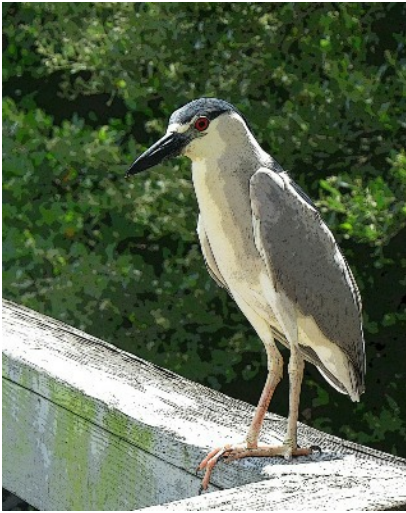
Night Heron in The Day By Mia Arrington Class B Special Techniques First Place