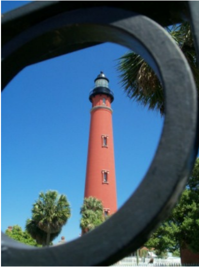
Ahoy By Dyan Chester Class B Color Third Place