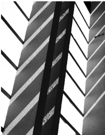
Arbor Day By Jenifer Lanam Class B Monochrome Second Place