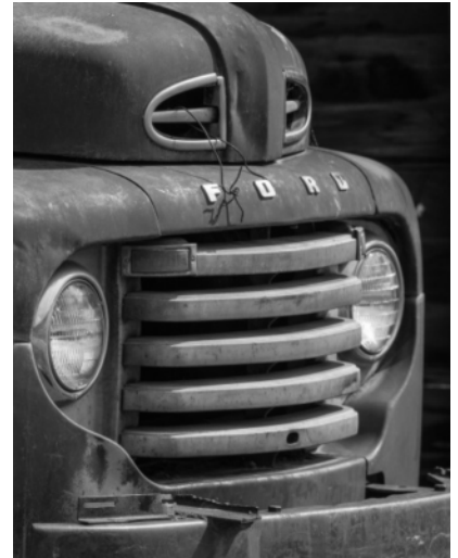
Old Ford By Barbara Rice Class B Monochrome Third Place