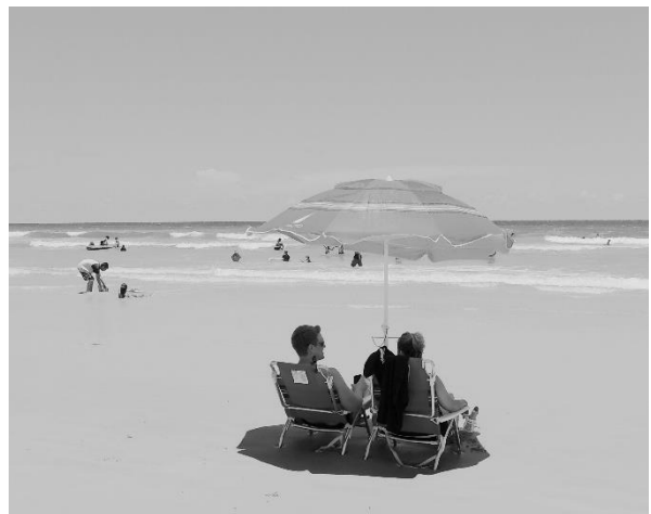
Arlene Willnow “Oasis” 3 rd Place Class A