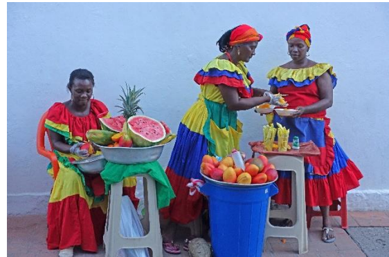
Rene Donars “The Fruit Ladies” 1 st Place Class B