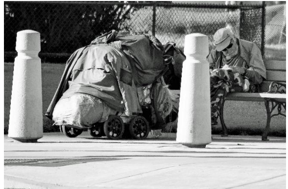
Diane Deluca “Homeless In San Diego” 3 rd Place Class B